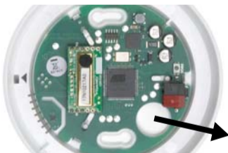
Fig. 4 Lead the bus cable through the cable bushing in the skirting.