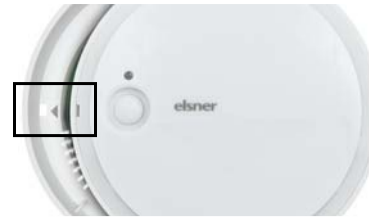
Fig. 7 Close the housing by positioning the cover and snapping it into place. To do this, align the recess on the cover to the marking on the skirting (Fig. 1+2: A).