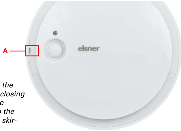
Fig. 1 A Recess to open the housing. When closing the housing, the recess aligns to the marking on the skirting