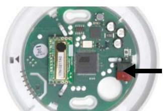
Fig. 6 Connect the KNX bus to the KNX terminal.