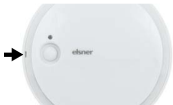
Fig. 3 Open the housing. To do this, carefully lift the cover from the skirting. Start at the recess (Fig. 2: A).